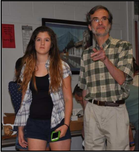
(The Beatty family)