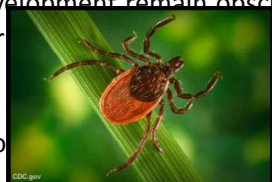
Centers for Disease Control

People in our region find Great Falls both fascinating and perplexing. Arguably our most dramatic landscape feature, its origin and development remain obscure to many. We will take a short and easy walk from the Great Falls Tavern Visitor Center to the bedrock of the Great Falls. The round trip of about a mile. During the walk, we will discuss how tectonic collisions hundreds of millions of years ago and how the waxing and waning of the ice sheets led to the much more recent creation of the falls. There should even be time to examine the flow path.